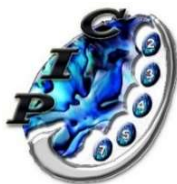
Paua Industry Council

2. NZ RLIC, PIC and FINZ are national representative bodies for the rock lobster, pāua and inshore finfish sectors of New Zealand's fishing industry. SNZ is a national organisation for the seafood sector. Our submission is made on behalf of our members who are quota owners, fishers and affiliated seafood industry personnel in rock lobster, pāua and inshore finfish fisheries. Collectively we directly represent commercial interests in all major inshore fisheries in New Zealand.